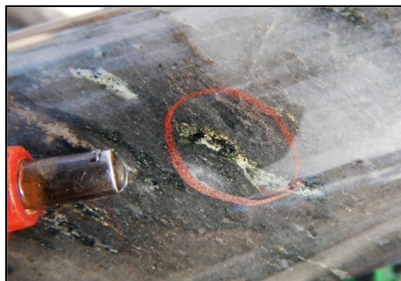
Photo 2: BBRD0756 Drill Core with Visible Gold at 201.5m (Mindil lode; see Figure 2)